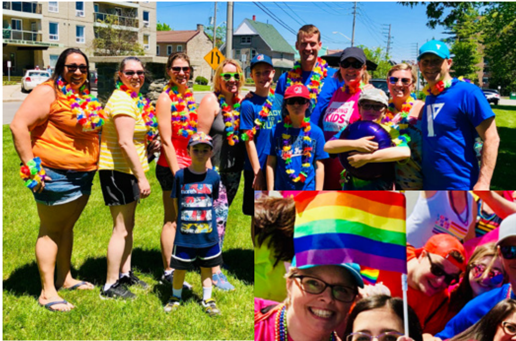
YMCA staff celebrate Pride Week.