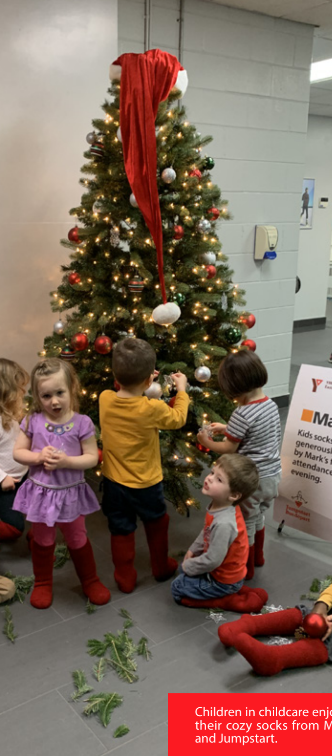
Children in childcare enjoying their cozy socks from Mark's and Jumpstart.