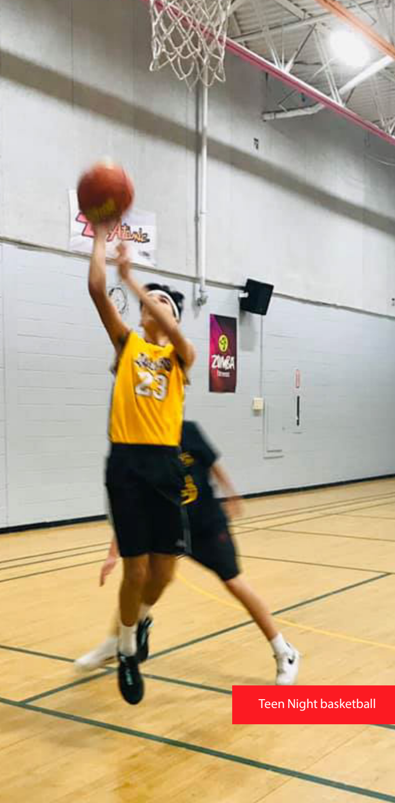
Teen Night basketball